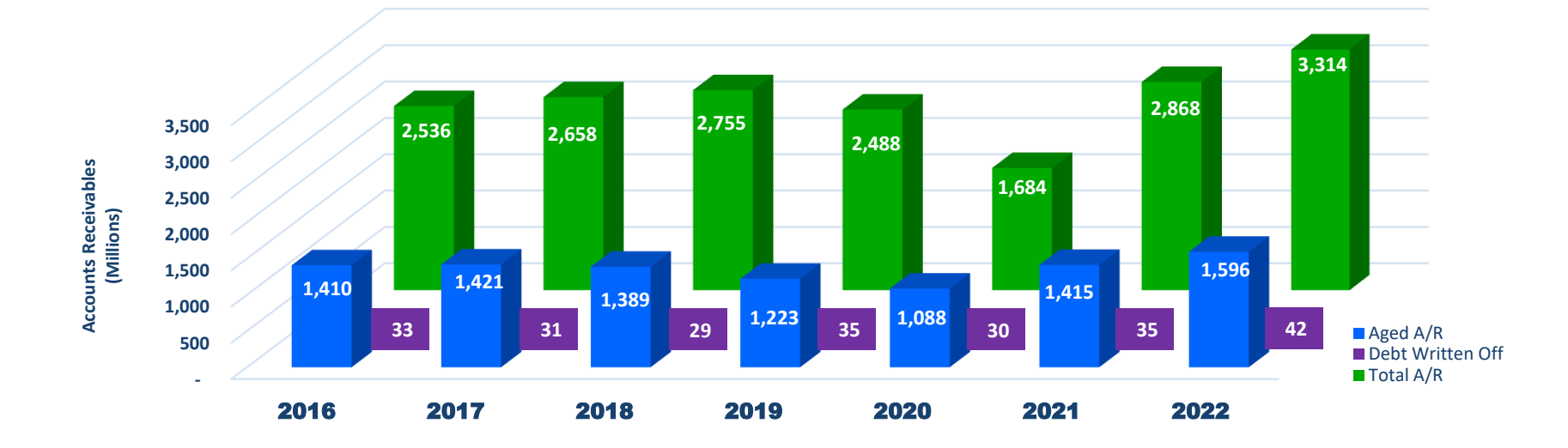
RATIO OF WRITE-OFFS TO TOTAL A/R